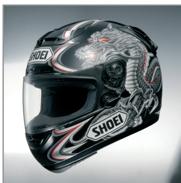
■ Feridax are the sole UK Distributor of SHOEI helmets

Tel: +44 [0]1794 500 200 or visit www.aspin.co.uk